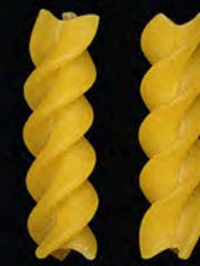
FUSILLI No. 495