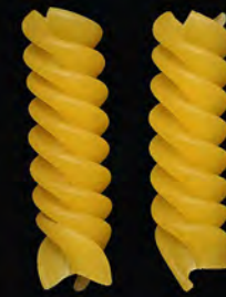
FUSILLI No. 133