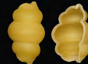
GNOCCHI No. 205