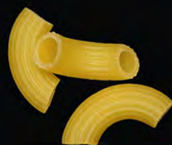
CORNETTI RIGATI No. 150