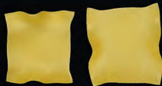
LASAGNE PASTA No. 1073