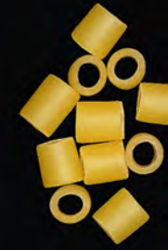
DITALI LISCI No. 103