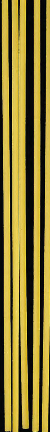
LINGUINE No. 20