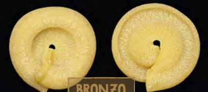
DISCHI VOLANTI No. 920