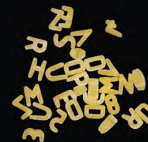
ALFABETO No. 313