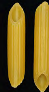
PENNE RIGATE No. 122