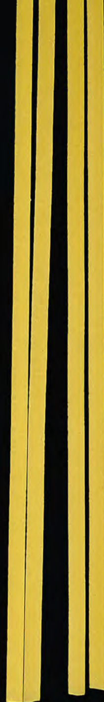
FETTUCCINE No. 26