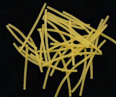
FILINI PICCOLI No. 388