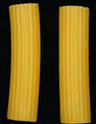
RIGATONI RIGATE No. 137