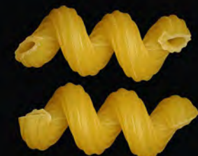
CAVATAPPI No. 566