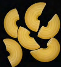
CORNETTI RIGATI No. 148