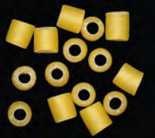
ANELLINI No. 101