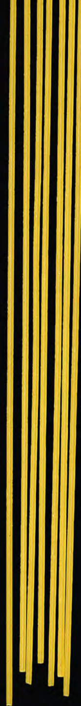
SPAGHETTI ● No. 5 (diameter 1.2 mm) ● No. 6 (diameter 1.4 mm) ● No. 7 (diameter 1.7 mm)