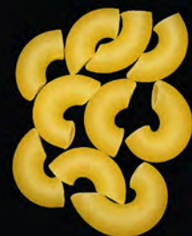
CHIFFARI LISCI No. 183 (normal / 6-8 min) No. 183 (quick / 2-3 min)