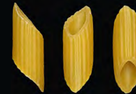
MEZZE PENNE RIGATE No. 122