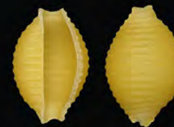
CONCHIGLIE RUSTICHE No. 198