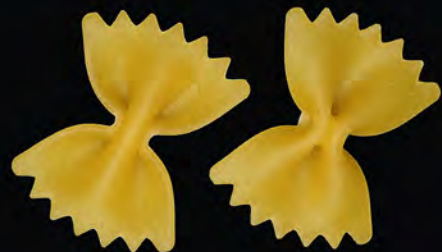
FARFALLE No. 103