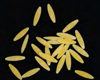
PUNTINE GRANDI No. 270