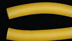
MACCHERONI LISCI No. 103