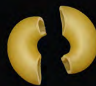
CHIFFARI LISCI No. 185